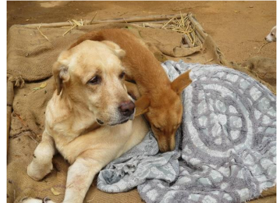
Buddy the Labrador and his friend Rex.

The same "owner" kept a small shelter where there were initially 48 dogs who were never allowed to go out nor were they given for adoption. At present nine are left, the rent is not paid and for several weeks the dogs went without food. Karuna has taken them in as well, to provide food and treatment (mainly for ticks).