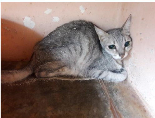
One of the nine cats, soon after being rescued.

Our area has a problem with several animal hoarders. In September 2017 we rescued nine cats from two tiny flats in Puttaparthi. They had been locked up for four years with no proper food, no fresh air, no sun and hardly any human contact. They only received cheap and substandard cat biscuits which were often left untouched; the cats had been starving for a long time. The air in the rooms was saturated with cat urine. It was a clear case of cruelty to animals. The former owner, a lady from USA, left India due to visa issues and was sending substantial money to a local rickshaw driver to care for the animals. Recently she had no more money to send and we obtained permission to rescue the cats. Needless to say, they were traumatised and difficult to handle.