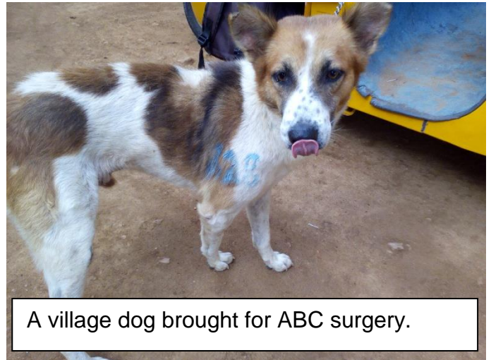
A village dog brought for ABC surgery.

Over the years we have performed over 13,000 ABC surgeries, mostly on females. We have a good operation theatre and inpatient rooms enough to house 30 ABC dog patients.