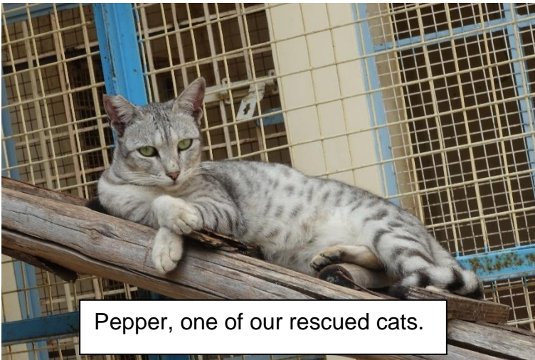
Pepper, one of our rescued cats.

It is our experience that the ABC/AR program can only succeed within the context of a general dog welfare effort where ALL dogs and cats receive first aid in emergencies, general surgeries and inpatient care when needed.